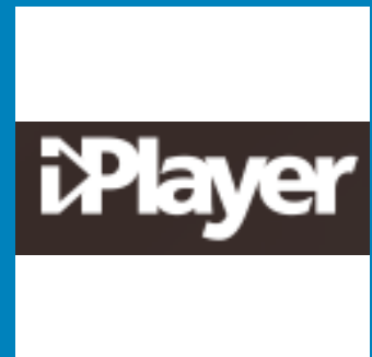
NEW iPlayer for Kids

Understandably there has been some widespread reporting in the media lately regarding the risk commonly known as sexting. See the NSPCC site for advice on talking to your children.